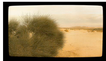
Keith Marroquin, Ephedra photograph, wood, plaster