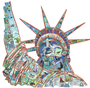
The Enduring Hope , 2017

In This Together: 60 years of daring to create a more perfect Arizona. Group exhibition touring AZ. Opens at