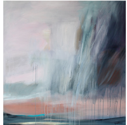
Desert Fury , acrylic

Sunrise or Sunset , group show, Herberger Theatre Center Art Gallery, 222 E.