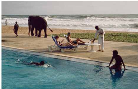
Tourists at a Resort, Bentota, Sri Lanka, 1995 Fuji Crystal Archive print

Steve McCurry, Takeshi Ishikawa: The Unguarded Moment , photographs, Sep 4 - Nov 10.