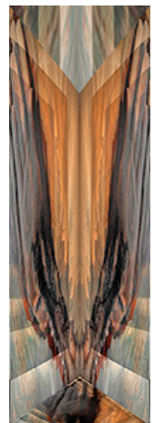
Human Impact Mirrored and Stretched

4 Artists , transluents, Yun Gee Park Gallery & Atelier, 4226 E. 2nd St, Sep 21 - Nov 10; reception Oct 27, 6-9p.