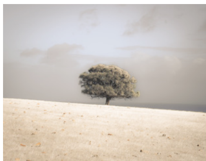
Lone She-Oak Tree by Ocean, Kangaroo Island, South Australia (n.d.) hand-colored, archival pigment print

Kate Breakey: Trees , mixed media photographs, Legacy Gallery, Tucson Botanical Gardens, 2150 N. Alvernon, Oct 1, 2018 - Jan 13, 2019.