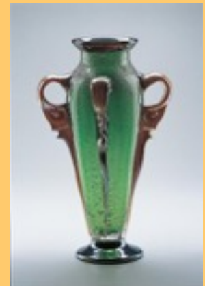
Tom Philabaum Green Venerable Vessel blown glass