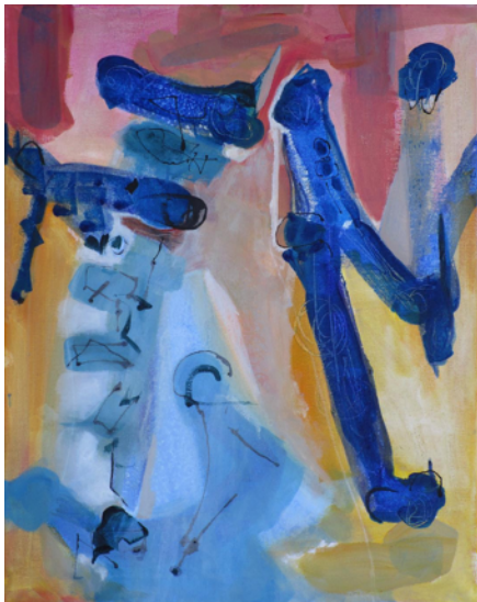
Fran McNeely, Fish-Nada , 2019 acrylic on canvas

An exhibition of CAS Artists at the Visual Arts Gallery, Pima Community College West Campus