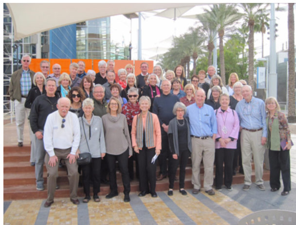
CAS members assemble during annual trip to Phoenix