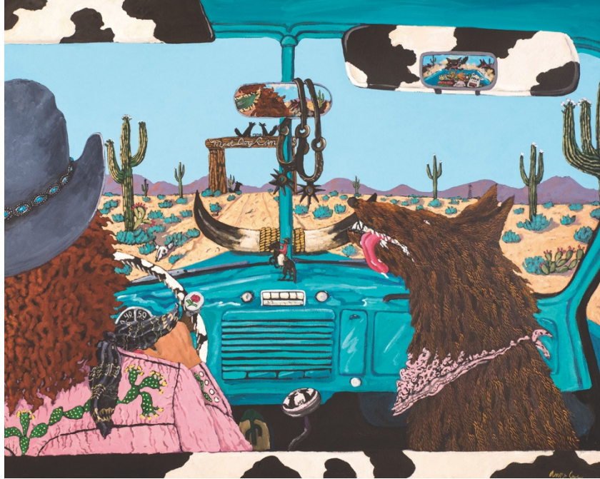
Anne Coe, Getting Supplies acrylic on canvas, 35 x 45 in. Private Collection