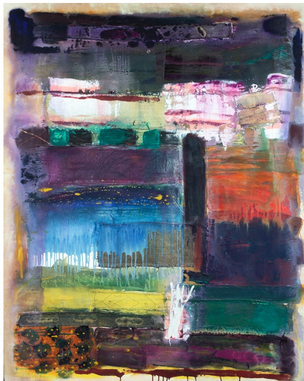
Dick Jemison, Detritus Series IV , 2007 mixed media on canvas, 60 x 40 in. Collection of the Tucson Museum of Art. Gift of the Artist.