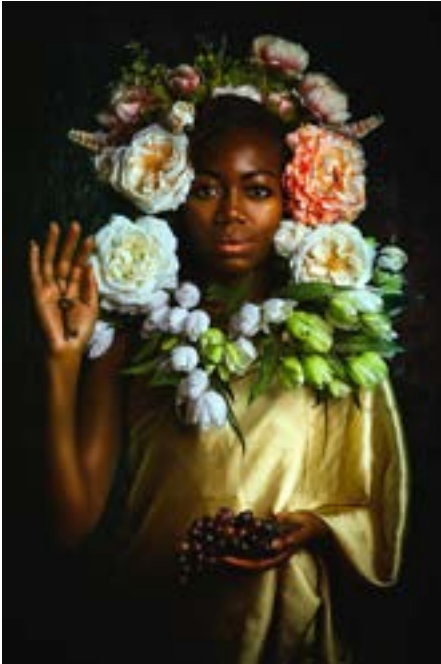
Alanna Aritam, Queen Mary (The Queen) , The Golden Age series, 2017, 32" x 48", photograph (printed on archival luster paper with archival ink, finished with hand-painted varnish to seal, protect, and add texture to complement painterly effect of the photograph)