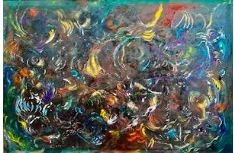
George Welch, Sangre 3 , 2021, oil pastel and acrylic on canvas, 4' x 6'