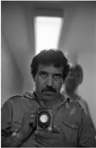
Untitled - Sin titulo, originally taken in 1983, scanned from a negative, printed as an Archival Digital Print.