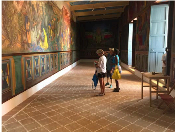
A memorial plaque appears at the Rodolfo Museum, along with Rodolfo's Municipal Palace Mural.