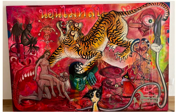
Contemporary painting at Manuel Dias Gallery.