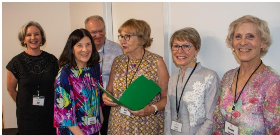
Members of the WAP Board electing new officers.