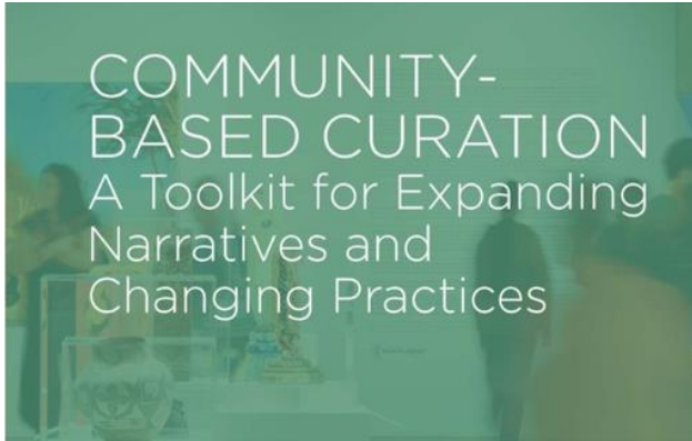
Detail of the cover of the Toolkit.

Over the past four years, many WAP members have heard about the Expanding Narratives project that used community curation. This approach of working with communities—from exhibition concept to installation to programming—communicates a monumental impact of how museums can develop relationships