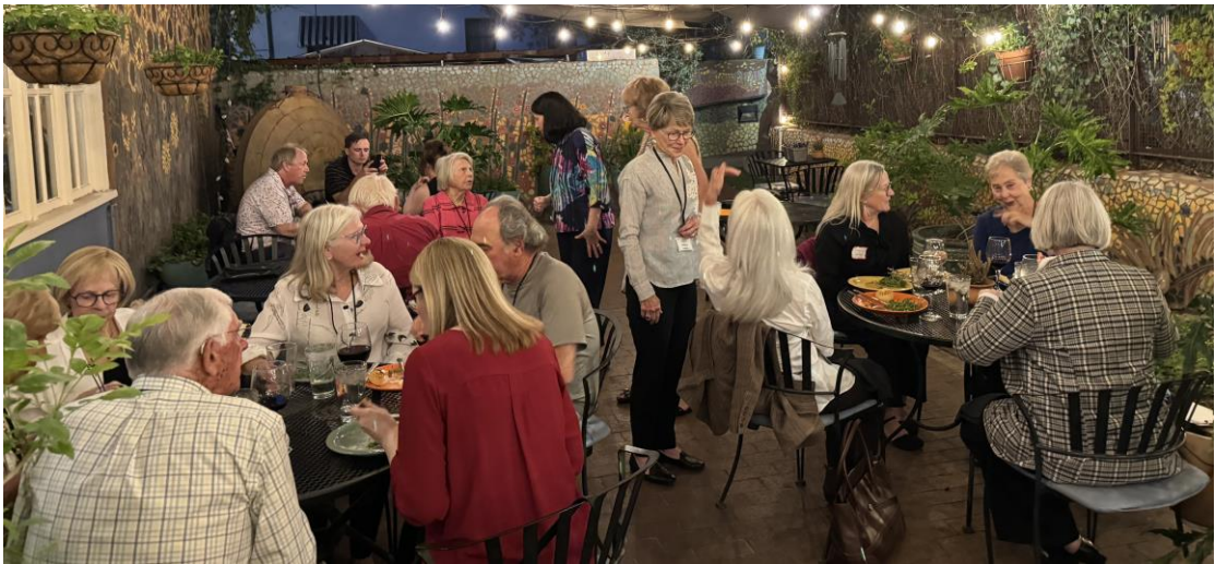
WAP Members at Café a la C'Art after the Annual Meeting.