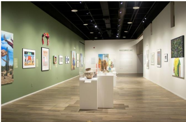
Installation of Southwest Art: Contemporary Conversations at TMA, the latest gallery to showcase community curation.

Today, the effect of community curation is visible in several of TMA's galleries, including the Indigenous Arts gallery, the Hamilton gallery featuring People of the West , and the Maxfield gallery presenting Southwest Art: Contemporary Conversations . This work has led to the publication Community-Based Curation: A Toolkit for Expanding Narratives and Changing Practices , a "how-to" guide that is gaining traction throughout the country with TMA at the forefront. I invite you to check out this collaboratively authored toolkit. It may give insight into the exhibition process that everyday museumgoers may not realize.