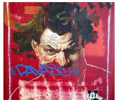
Isaac Pelaso, Pinche Payaso , 2023, Oil, oil stick, acrylic, aerosol on wood, 40 x 30 in.