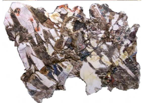
Marvin Shaver, Transform your Business USA Sculpture , 40 W x 32 H x 2 D in.