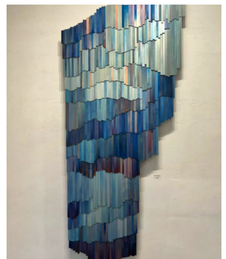
Moran/Brown, Blue Stalactite , 75"h x 34"w x 2"d, layered aluminum on aluminum framework.