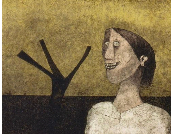
Mujer sonriente by Refino Taymayo

Opening reception: Thursday, February 7 from 5:00 -7:00 pm