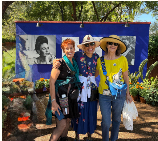
The tour was an opportunity for friends to gather in a beautiful environment on a sunny fall day.