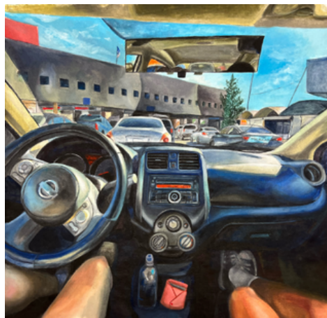
Enlight1451 by Vanessa Saavedra

Tucson Desert Art Museum, 7000 E Tanque Verde Rd