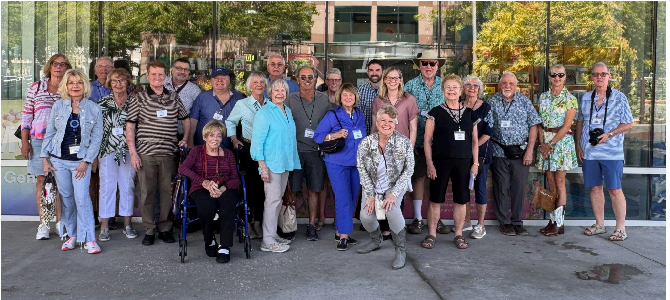
Western Art Patrons outside the Nevada Museum of Art in Reno, Nevada

Tucson Museum of Art and Historic Block 140 N. Main Avenue, Tucson, Arizona 85701