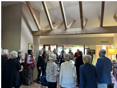
WAP Patrons & Benefactors at the 1/11/26 Party