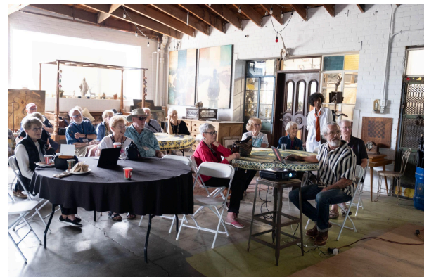
WAP members at the artists' studio

and then he prints the photographs. He showed us pictures of his cameras and his photographs. One of his projects that was fascinating was his work in Mummy Cave in Canyon de Chelly that had not been visited by any non-Native person for many years.