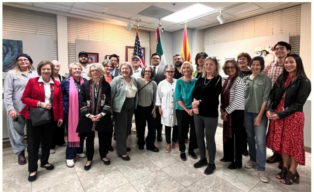
A total of 17 artists submitted their work to the The "Latin American Art Patrons: Primera Exhibición."