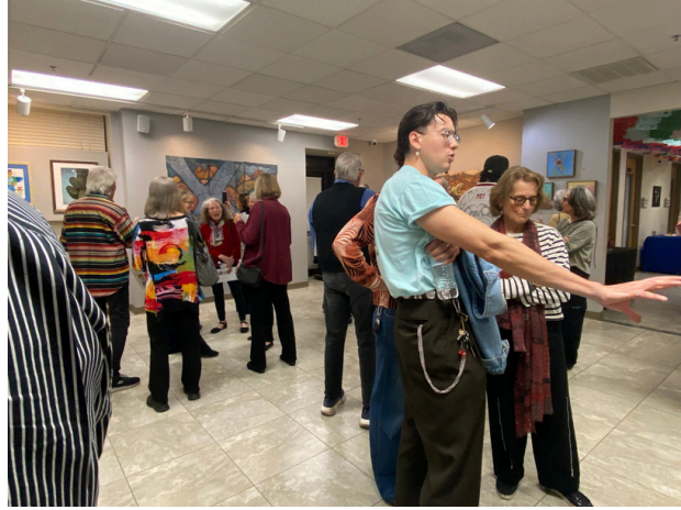
The Latin American Art Patrons: Primera Exhibición” opening was well attended with many commenting positively about the quality and variety of the artwork on display.