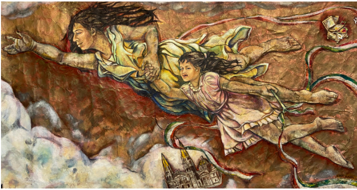
“Crossing the Border” by Christina Cardenas, a piece painted with gouache and acrylic on bark/amate paper, was included in the exhibit.